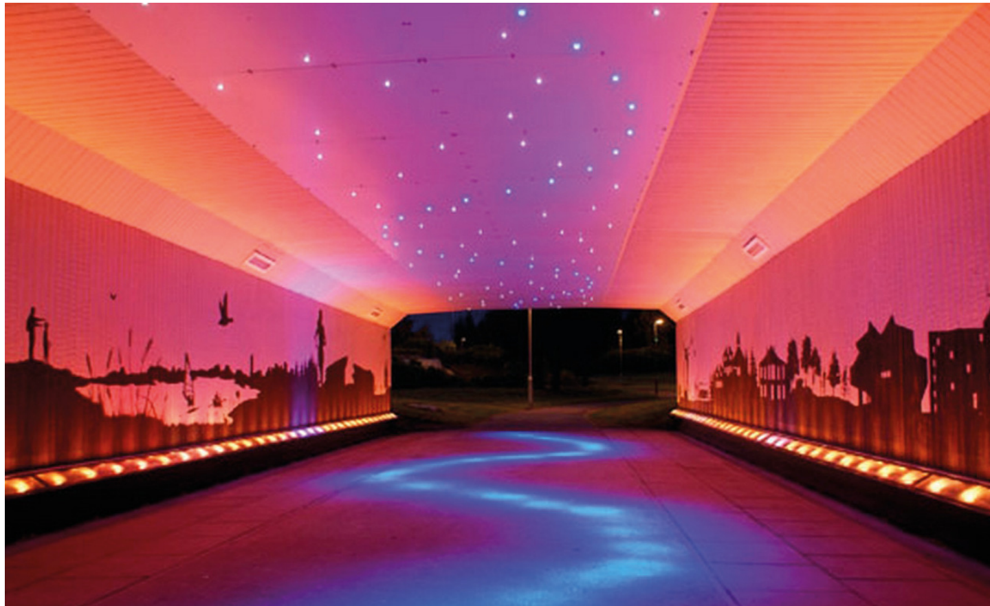
Underpass lighting and art example